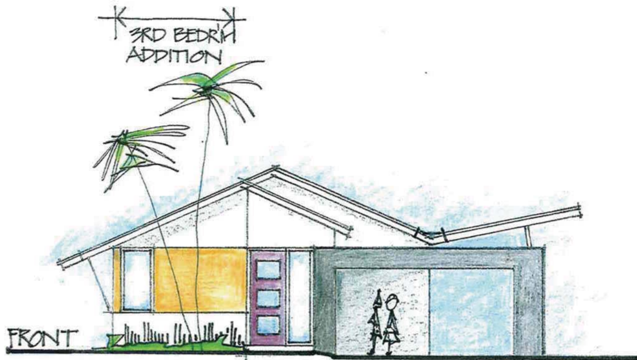
SK07 TYPICAL ELEVATIONS (three bedroom)